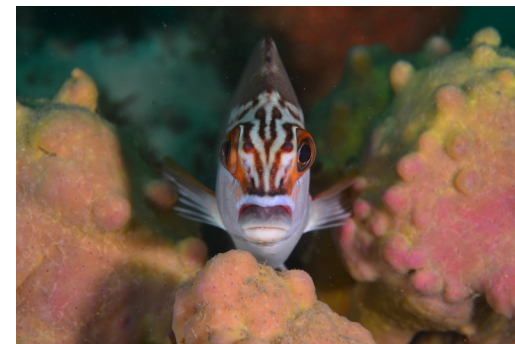
Fly Point - QR Code Accepted Edi Payrleitner