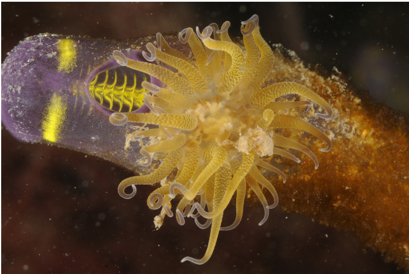
Anemone Fly Point