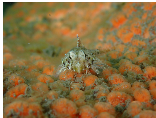
Fly Point _ Stinkfish Accepted Kate Tinson