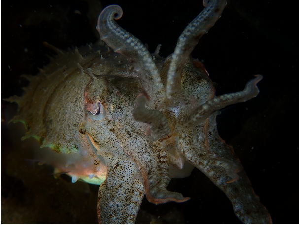
Little Beach_Tentacles Highly Commended Kate Tinson