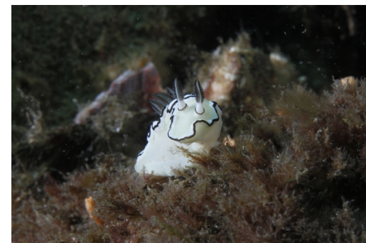
Swansea Black Margined Nudibranch Accepted Matt Dowse