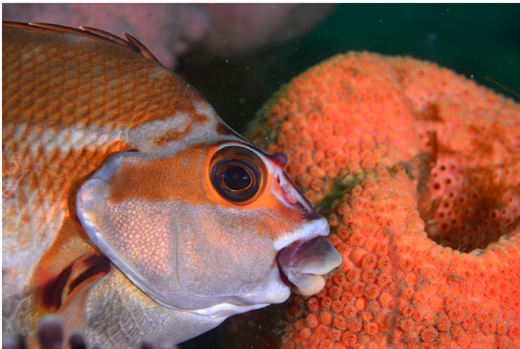
Fly Point - Is this my best side