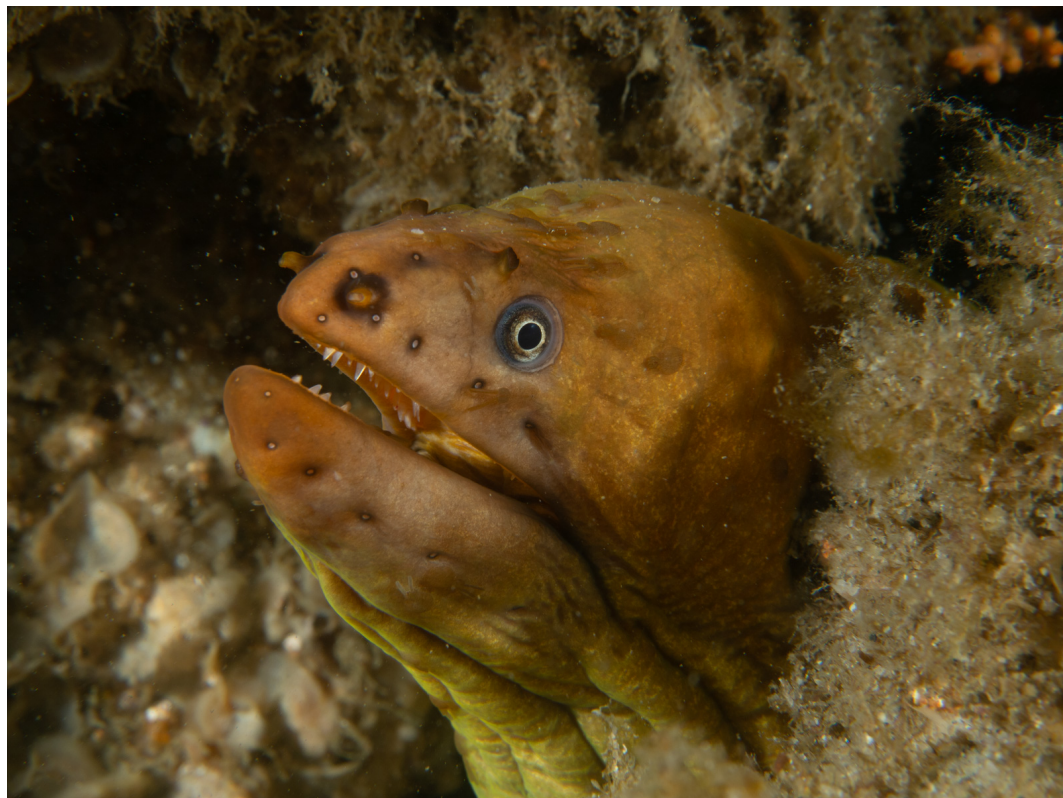
Swansea Channel- Moray Eel