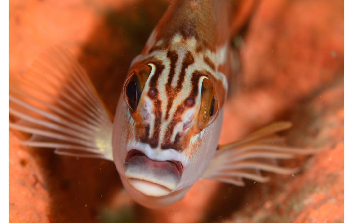
Fly_Point_110323_Eye Balling Highly Commended Ian Marriner