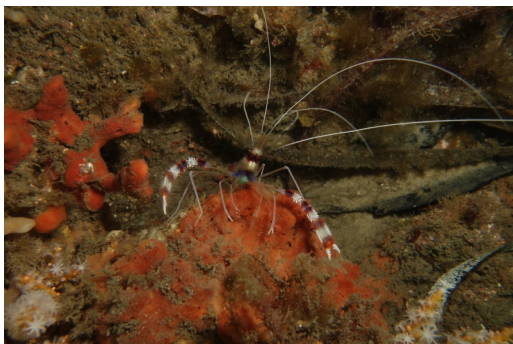
Fly Point _ banded shrimp Accepted Margo Smith