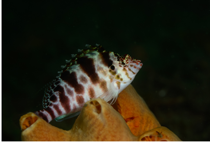
Little_Beach_060323_On_Lookout Highly Commended Ian Marriner